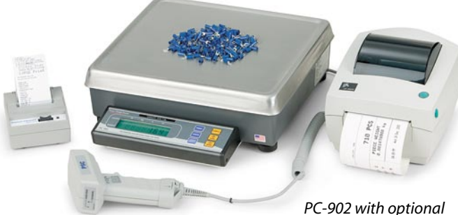
PC-902 with optional barcode gun and printers.