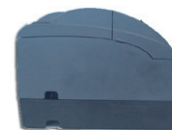
Power supply case fits under printer without increasing footprint size.